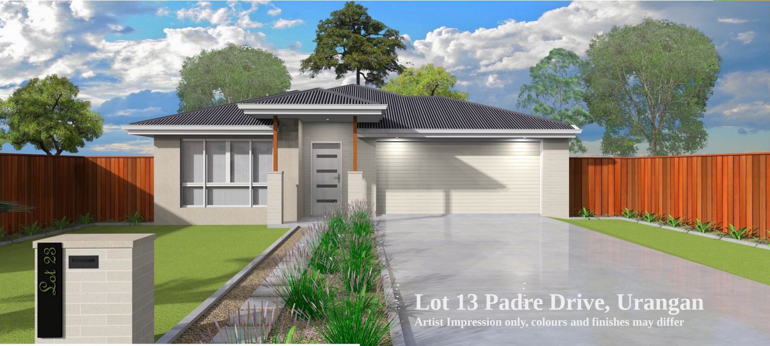
Lot 13 Padre Drive, Urangan Artist Impression only, colours and finishes may differ