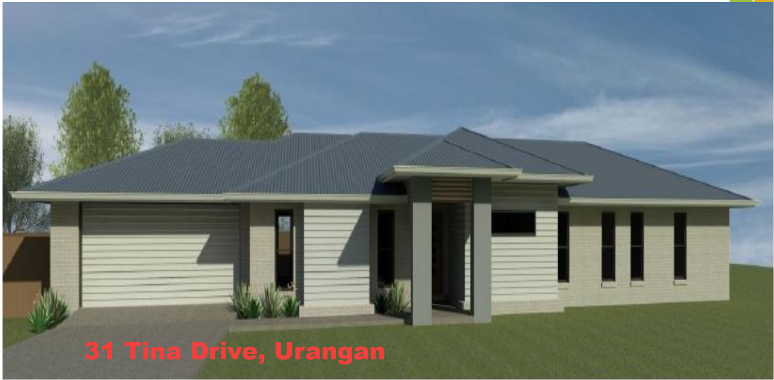
31 Tina Drive, Urangan